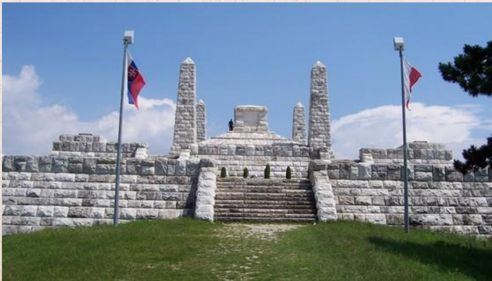
The Barrow of Milan Rastislav Štefánik (Brezová pod Bradlom)