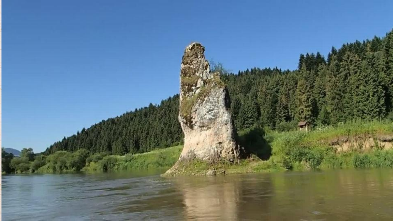
The Devil's Rock