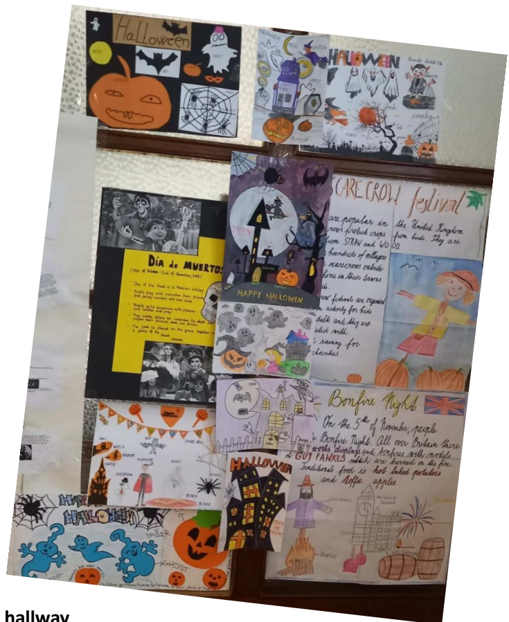
Annual autumn project display in Pribinka hallway